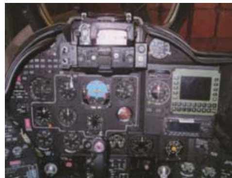
Fig. 2. The cockpit with components of the communication system in use until now (left) and the ITWL-developed integrated communication system ZSL-1 (right) built into the Mi-24 helicopter

To control the integrated communication system on the Mi-8, Mi-17, and Mi-24 helicopters, pilots use control panels of the PSL-1 type (Fig. 3), which allow of the selection of a radio station and changes in the settings of performance parameters. The control panel PSL-1 includes a colour LCD display, 4 \times 3 inches in size, with software of its own. The control-panel display shows, among other things, states of internal and external connections, the type of communication performed, and radio station performance characteristics. A pilot can select an internal subscriber or the radio station via the control panel, the connection being executed by the communication server. The already constructed ZSL system can be expanded with additional functions, depending on the user's needs [5].