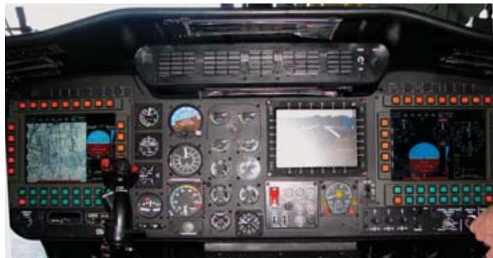
Fig. 4. The cockpit with components of the ITWL-developed integrated communication system built into the W-3PL helicopter

The W-3PL cockpit (Fig. 4) is outfitted with two multifunction displays MW-1 that control the communication system, inform of the operational status of particular radio stations and whether/to what extent other components of the integrated avionics system remain fit for use. Selection of the mode of operation depends on the aircrew decision. Every aircrew member has their own display with a visual representation of a complete set of data essential to perform the mission. All the data are visually represented on these multi-function displays in a fully independent manner.