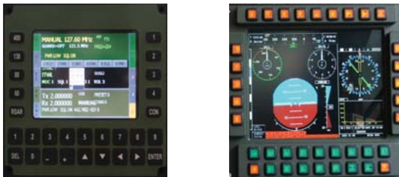
Fig. 3. The PSL-1 control panel (left) and the MW-1 multi-function display (right) included in the ITWL-developed integrated communication systems

communication server, control panels, the radio station set) are interchangeable and can be used on helicopters of different types. By the way of example, the integrated avionics system (the so-called macro-system) has been built into the W3-PL helicopter; the integrated communication system is one of the components thereof [3]. This one is the most ‘expanded’ version of the integrated communication system ZSŁ built into a military helicopter operated by the Polish Land Forces. It comprises, among other items, the digitally controlled radio stations of the RRC, HARRIS, and MR6000 types; and three displays of the MW-1 type (for the commander, the co-pilot/operator, and the cargo/troop compartment commander).