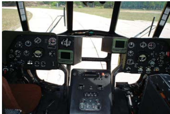
Fig. 1. The cockpit with components of the ITWL-developed integrated communication system ZSL-1 built into the Mi-8 helicopter

co-pilot/navigator (right station) can use the radio communication system simultaneously and select the mode of operation of radio navigation devices in the range of the so-called navigation signals from the VOR, ARK, TACAN, and MRK systems [4].